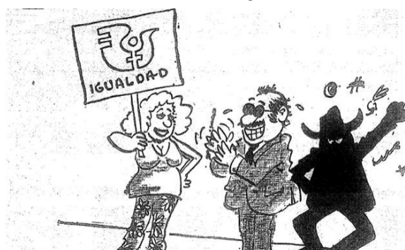
Figure 1 "Con el Machismo por Dentro"

But why was an International Women's Year conference in Mexico City in the first place? To many feminists, holding a women's conference in the machista environment of Mexico made about as much sense as holding the UN's 1968 human rights conference in Teheran, under the shah's notorious repression. One US feminist, warning about the Mexican government's propensity for violent repression wrote in a newsletter, "Firstly, Mexico City is the most chauvinistic 'macho' city around, and it seems paradoxical why the event should be held there. Perhaps it's a set up by the CIA, FBI, etc." (OAC, 1975: 11). Judy Klemesrud, reporting for the New York Times , noted: "Many people find it ironic that the first world conference on women's rights should be held in one of the world's most macho capitals, Mexico City" (Klemesrud, 1975b: 7). Reflecting after the conference closed, Newsweek magazine reported: "It seemed like a male-chauvinist joke –holding the first major international conference on women in a stronghold of macho, Mexico City" (Anonymous, 1975a: 28). The Mexican press got in on the act, too. The cartoonist Sergio Iracheta penned a satirical column in El Universal , alongside a cartoon of woman in low-cut tank top and flowered pants carrying sign with the IWY logo captioned "IGUALDAD", accompanied by a mustachioed man in a suit and sunglasses smiling and clapping while his shadow wears a cowboy hat and shakes his fist in the air, fuming and cursing.