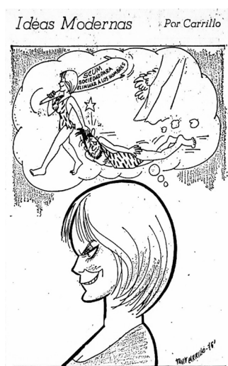
Figure 3 “Modern Ideas”

Friedan and others further antagonized fellow attendees when they arrogated to themselves the right to represent the NGO tribunal to the governmental conference, presuming to speak for an authentic feminism (Olcott, 2017).